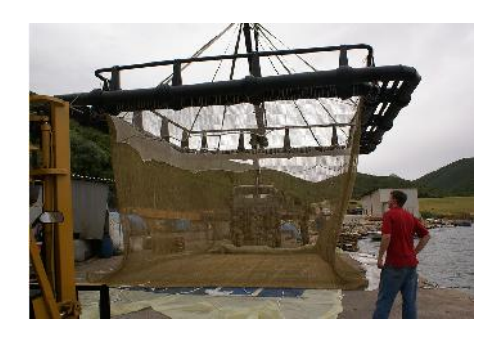
Photo Centre: Parasites find it hard to attach to smooth alloy surface