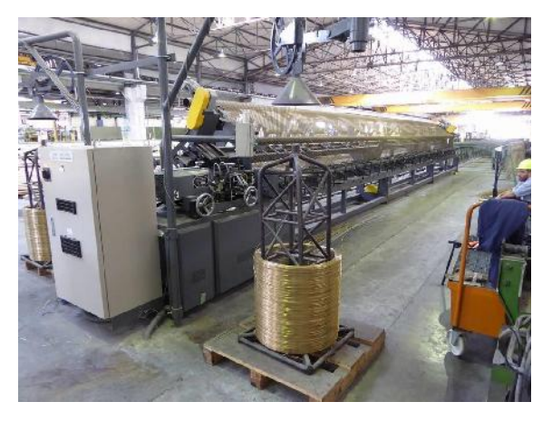
Photo Below: Shows mesh panels being joined together with copper alloy wire. Brass is strong but malleable.